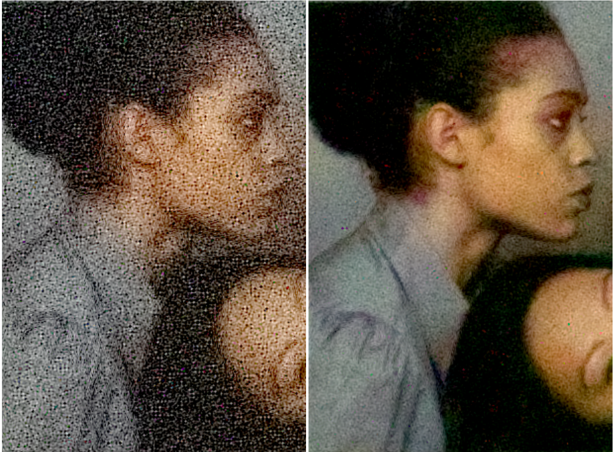
Figure 3: A crop of the “TE42” chart in low D65 light captured by the proposed RGBC-IR image sensor demonstrates the benefit of IR illumination. IR illuminator off (left) and IR illuminator on (right).